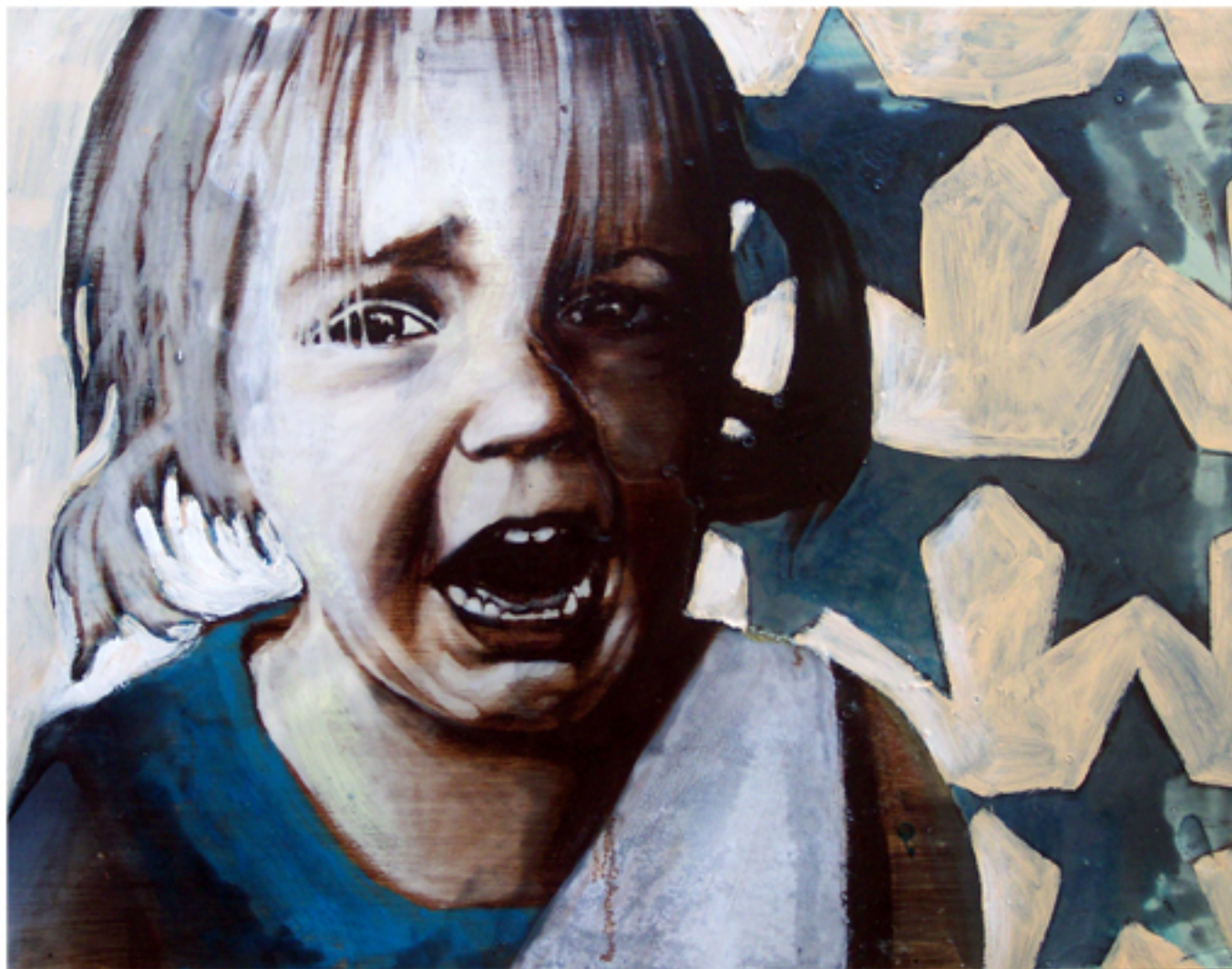
starlet. Oil, resin, wax on birch panel, 2005. (24" x 18")