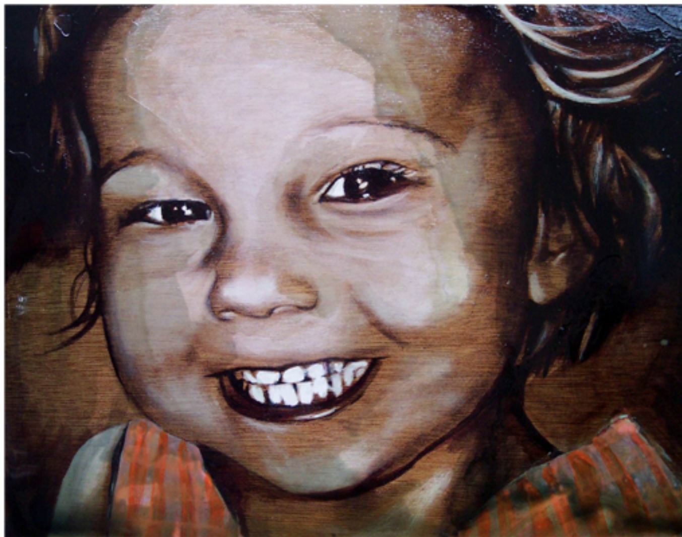
(above) sweetheart. Oil, resin, wax on birch panel, 2005. (18" x 24")