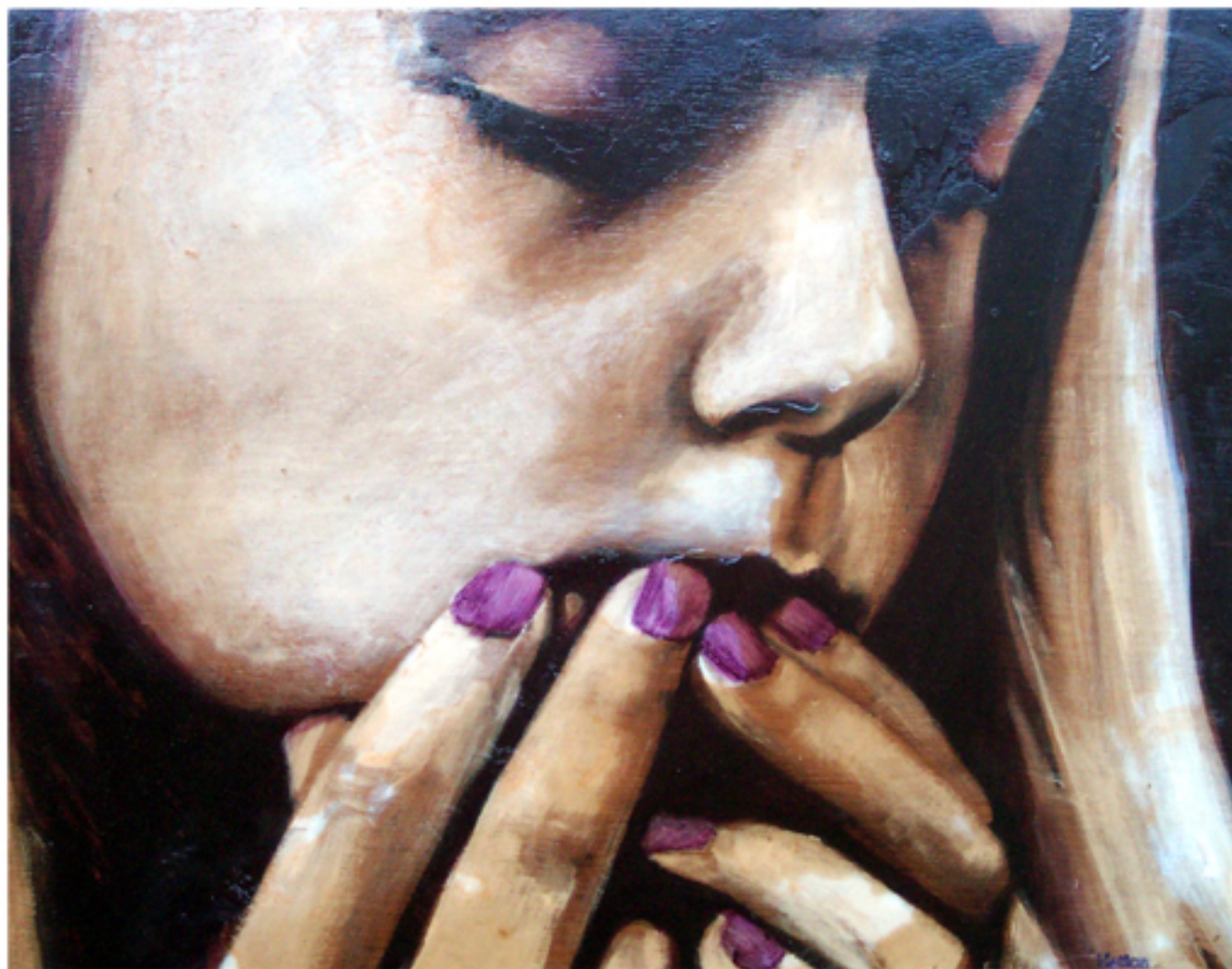
(above) doll-face. Oil, resin, nail enamel birch panel, 2005. (24" x 18")