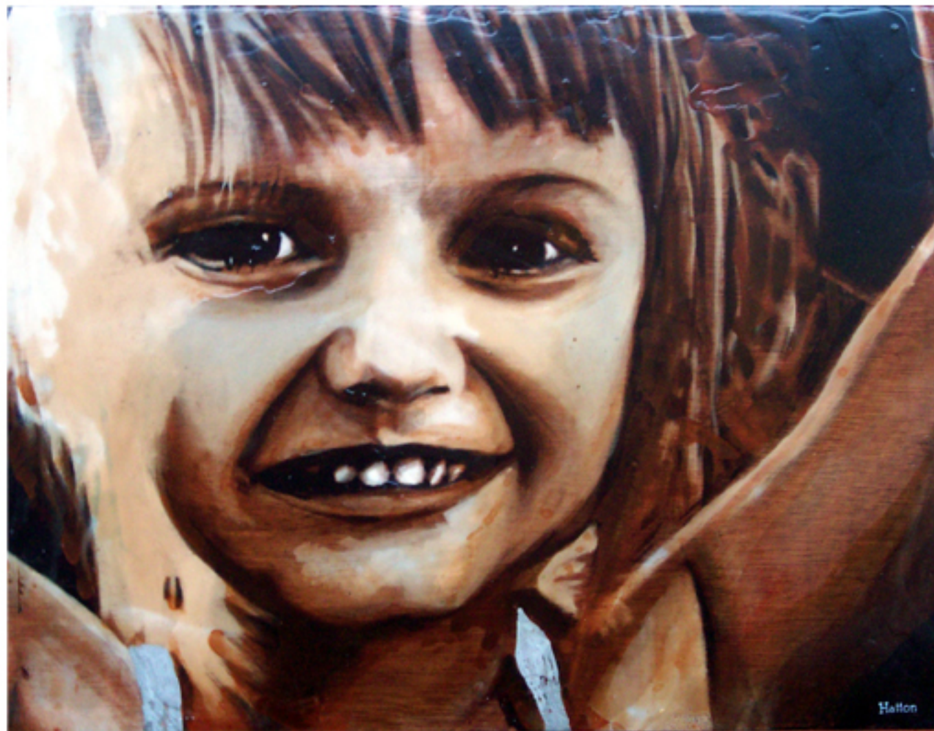
(above) sunshine. Oil, resin, metallic marker on birch panel, 2005. (24" x 18")