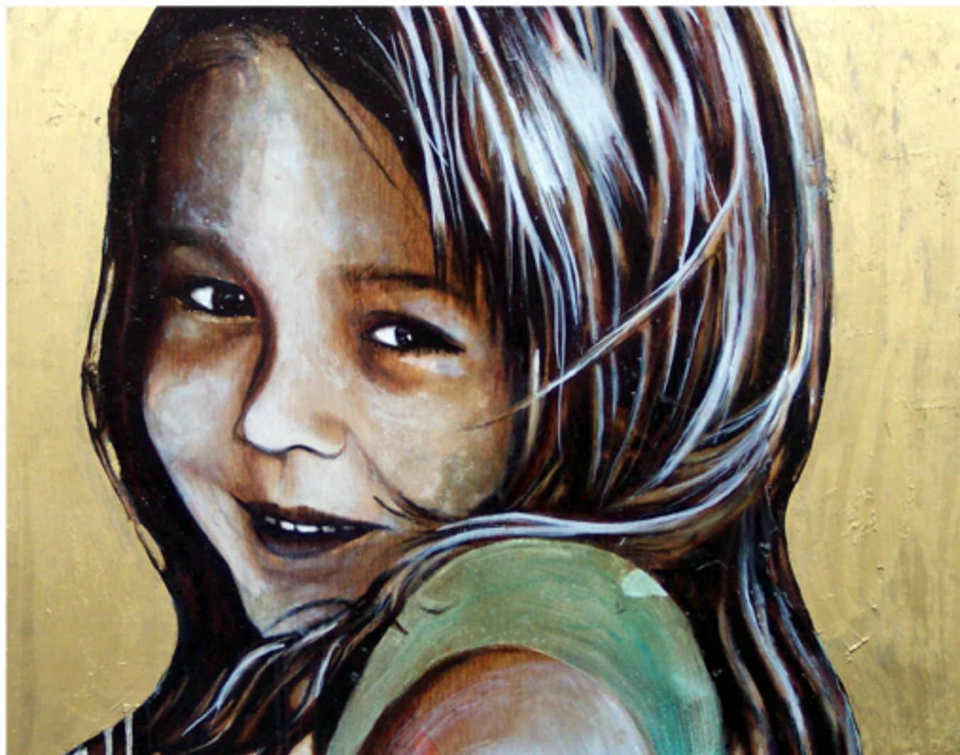
(above) cutie-pie. Oil, resin, wax on birch panel, 2005. (30" x 24")