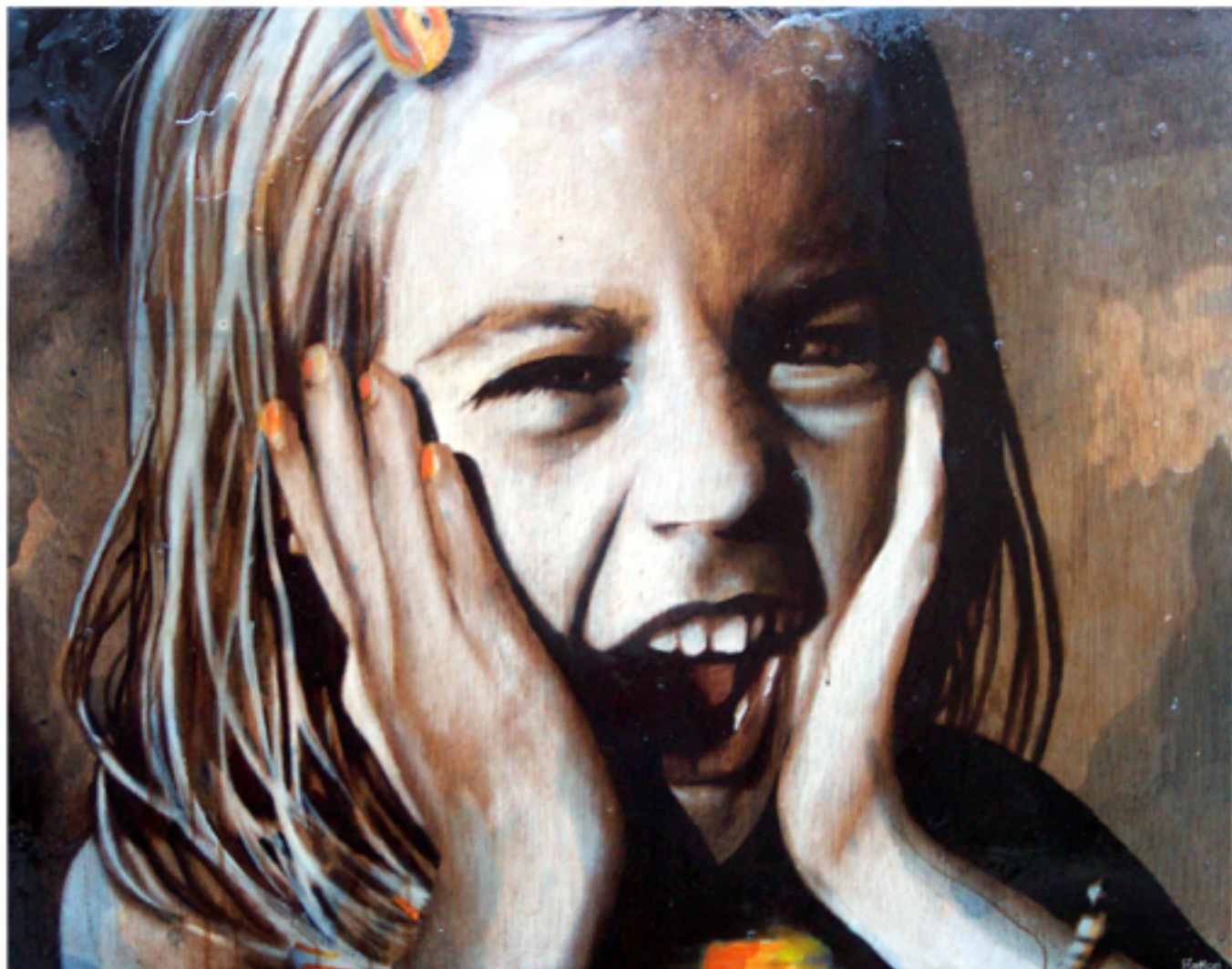
sweetie. Oil, resin, wax on birch panel, 2005. (24" x 30")